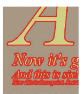
Trapping without automatic small object protection

This feature stops traps from obscuring the objects which they are trapping and corrupting the look of the objects. It protects all object types including text.