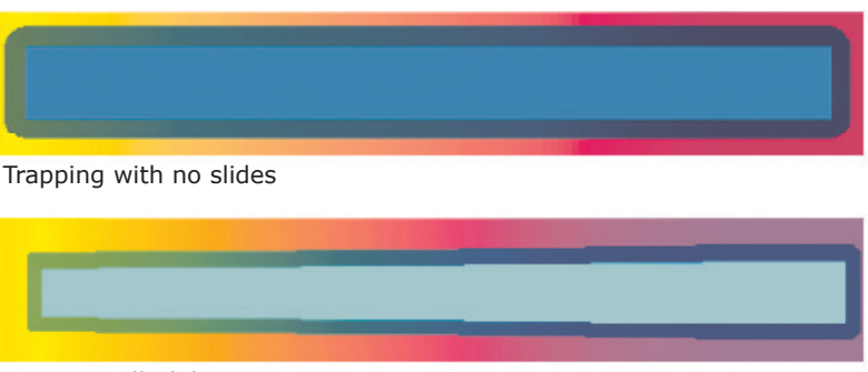
TrapPro Full Sliding Traps

When adjacent colors have similar neutral densities, TrapPro automatically slides the trap position from spreading the lighter color into the darker color.