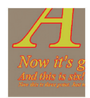
TrapPro Full automatic small object protection